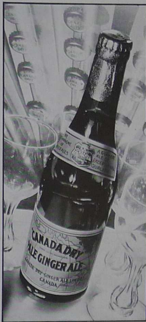
On the airways of this country, and at airports, "Canada Dry" is often served.