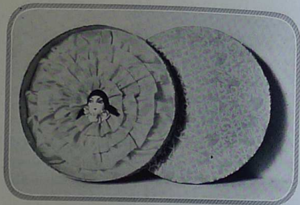
The piquant little face on its silken pillow of pleated ribbon makes an attractive lid for this dainty handkerchief holder; a design quite new and individual for one's dressing table. John Northway & Son, Ltd.