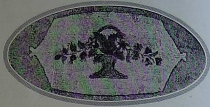
Many charming and useful things are being produced throughout Canada by cottage industry. Picturesque and colorful is this example of a punched rug made from old sweater wools on a burlap base. From Peniticon Women's Institute, British Columbia