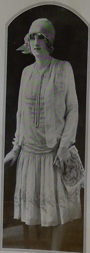
A study in the contrast of powder pink and blue, softer still in georgette, with exquisite ribbon traceries and embroideries. Charming for the garden party