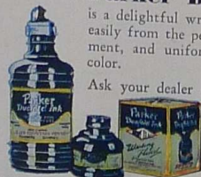
Blue-Black, Red, Green, Violet, Jet Black, Blue.

Ask your dealer for it by name. It will ensure that you get the very best results possible from your pen.