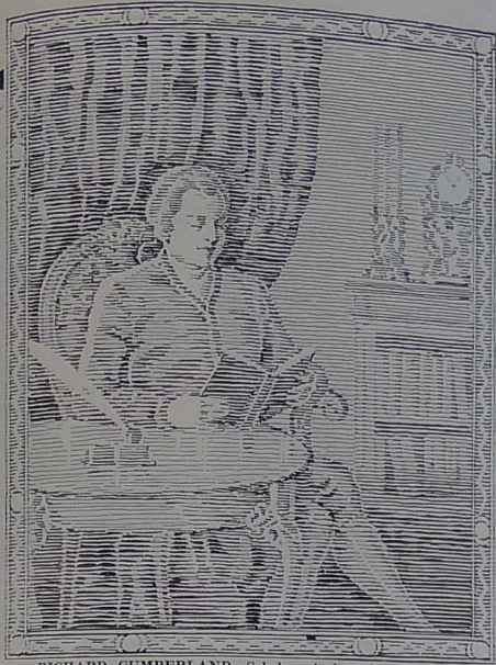
RICHARD CUMBERLAND—Scholar—Ambassador—Dramatist 1732-1811