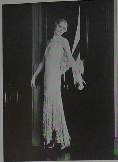
Filmy lace in rich ivory tone fashions this evening gown with its molded silhouette and dipping hemline, while a flaring cape floats from the shoulder. From Isobel, of London, England