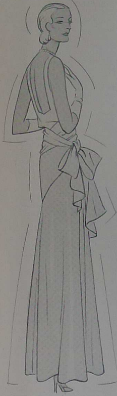
The lovely classical lines of this gown call inevitably for PANNE SATIN, a fabric by Canadian Celanese Limited. The new Pansy shade would be smart. Vogue Pattern No. S 3434.