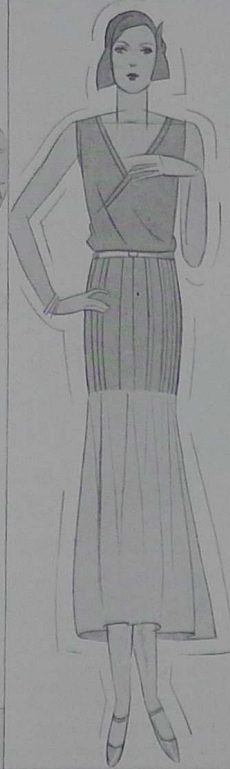
SYRINGA CREPE, a new Fall creation by Canadian Celanese Limited, makes a lovely dress, stressing the unpressed plaits, which are a feature of the classic mode. Chic in Manilla & Philippine.