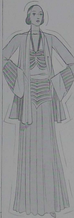
After Lanvin. A tea-gown of Grecian influence. For delicate flowing lines like these, Heavy SHEER-CREPE, a fabric by Canadian Celanese Limited, beautifully interprets the classical mode.