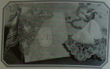
What more appropriate for the dainty debutante or smart woman, than a box of exquisite lace-trimmed handkerchiefs. Evangeline Shops, Toronto