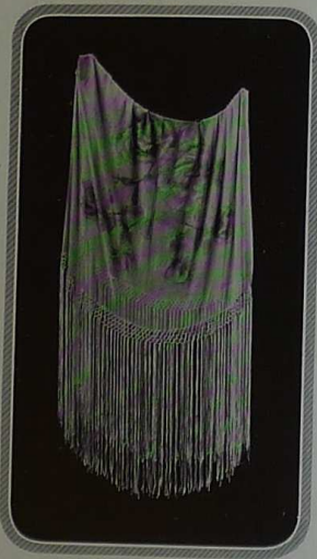
The gift every woman adores — beautiful, fluffy scarfs, from gay Paris; Georgette hand-painted in great wonderful roses and other floral designs. Long fringe, hand knotted. Davidson's Toggery, Toronto