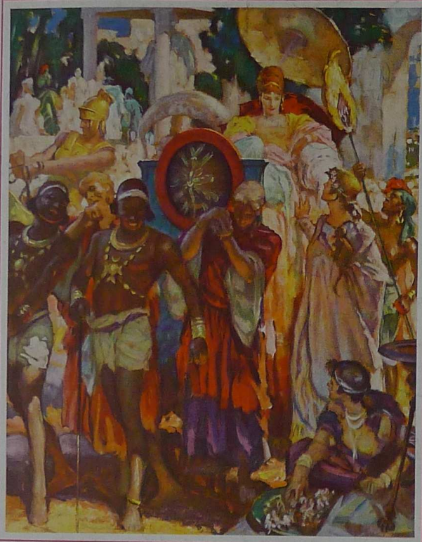
The patrician matron of Imperial Rome traversed its narrow streets in the ornate lectica, borne by gorgeously liveried slaves and followed by a numerous retinue

THREE years ago Packard published this statement. "Three things guarantee the maintenance of Packard reputation: The finest motor cars which Packard's unsurpassed experience and facilities can build. Business dealings governed by the strictest interpretation of the company's duty to Packard owners. Advertising which never in word or picture deviates from the conservative facts."