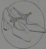
This model shown in Patent Kid, Lido Sand Kid, Navy Blue and White Kid ..... $14.50

Easter marks the advent of Spring. It is a season of brightness and beauty, of gladness and song.