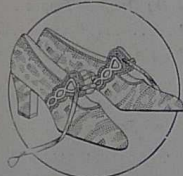
This model shown in Genuine Beige Water-snake, Brownstone Kid Trim ..... $16.50

Custom has decreed that one of the manifestations of joyousness shall be the Easter parade, that informal, colorful procession of smartly dressed women.