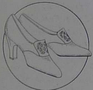
This model shown in Brownstone Kid with Beige Clair Kid trimming ..... $14.50

Join the parade, happy in the thought that no detail of your apparel is open to criticism, from the chic millinery to your modish ARCH-AIDS, and more than all else, your feet are comfortable for ARCH-AIDS need no breaking in.