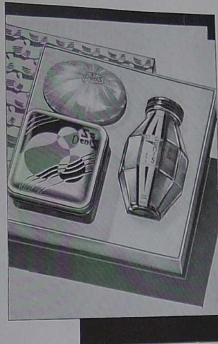
A large sized jar of rainbow crystals, a large sized box of bath powder and a cake of fine soap, boxed in the smartest manner, $2.50.