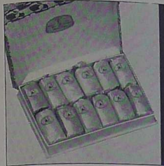
A dozen little sacs of St. Denis bath crystals in a gay assortment of colors and appropriate odors. $1.

breathes distinction and in a flat amber container raved stopper. Another of bbard Ayer's creations is a rich and luxurious floral stained in a square crystal etched with a stopper in s. Of intricate open-work delicate workmanship is the d container of Panter Fleurs, f flowers with the morning glistening on their petals ect assurance and poise of the ntlewoman emanates from scenter, in a lovely old world of finely cut crystal. As the choice of the refined and so Corday's Femme du Jour is of the sophisticated woman of