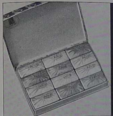
Twelve guest cakes of St. Denis soap in rainbow colors, delightfully per- fumed, for the guest or the traveller's use, $1.