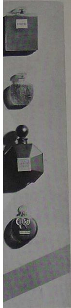
bottles of fascinating titled in modernistic is in finely etched Company