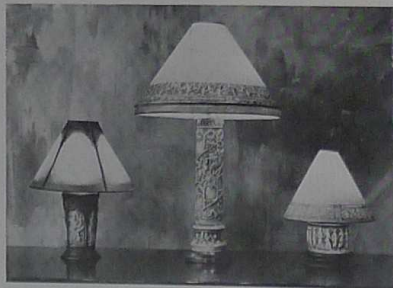
Below: Greek festivals, medieval banquets and ascetic friars are portrayed in plaster bas relief on lamps with goat-skin and parchment shades in brown tones. From E. Wills-Henderson