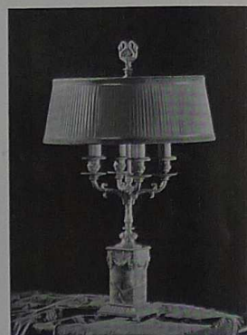
Right: Elaborate candelabra with a French gold Brazilian onyx base, of intricate design, taffeta shade in green and brown tones. From McDonald and Willson