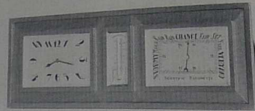
A barometer-clock combination is an ingenious device. This one is framed with a band of engine-turned gilt metal between inner and outer nickel frames. T. Eaton Co.

Write for booklet to Harold Webster & Sons 25 Wellington St. E. Toronto