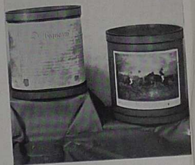
Two waste paper baskets to fit comfortably into the masculinely inclined room. Quint old English script covers the one at left, and a colorful hunting print adorns the one at right. Chowne