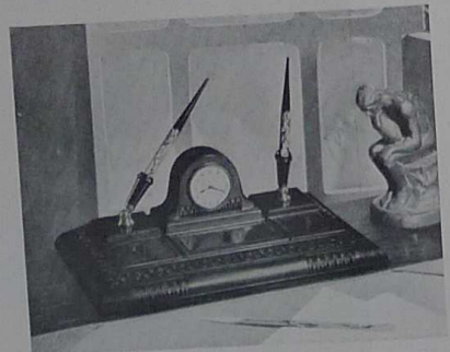
Dark bronzed metal is the medium of this interesting version of the clock and desk set with its eight-day Waltham clock. Modernistic pen handles and covered compartments for stamps and blotters are unique features. Parker Fountain Pen Co.