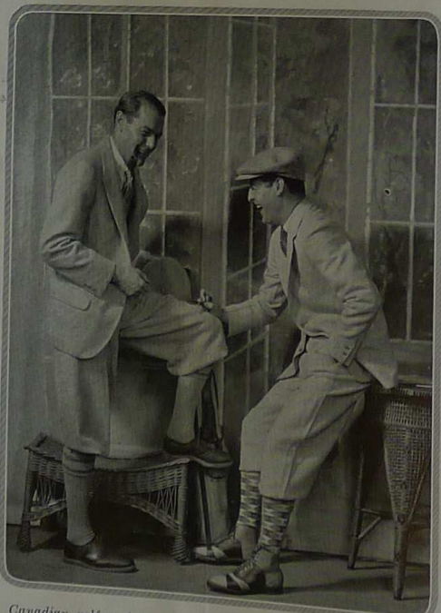
Canadian golfers have never been offered a greater variety of golf attire than in the last two months with tournaments across the Dominion, and the visit of the distinguished British players. Noticeable was the absence of freak or fad costume; in fact the conservative costumes illustrated are typical of the saneness with which the best golfers dress when actively engaged in the game. While this season's trend has been toward plain suits and toned socks, there is still a very great leaning toward the brilliantly checked or plaid socks and pull-overs

Two noticeable trends here! The one is the bowler hat which is so definitely swinging into real popularity. The bowler—or the derby as it is more popularly known in Canada—will very probably supersede the gray felt hat, which has been popular now for many seasons, and, with the oncoming of autumn, we shall probably see the derby worn more and more in our Canadian cities. Whether or not Canadians will take up the wearing of pull-over sweaters for daytime business wear remains to be seen. The younger element has been doing it somewhat but the more conservative business man has by no means abandoned his waistcoat and we doubt very much, comfortable and all as the sweater may be, if Canadian business men will show this preference.