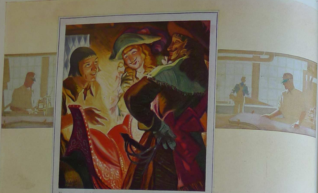
The ancient craft of fine leather working found expression in the seventeenth century in the cavalier's equipment.