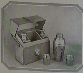
A little souvenir of your stay in Toronto, this cocktail outfit consisting of shaker and two bottles in a compact leather case. From Ellis Bros., Toronto

So much thought and care is put into the making of a Fleurette. If the lady is fair and her favorite color is orchid, just see the wonderful blending of shades—fragrant mauve sweet peas—a delicate orchid—deeper tones, quiet violets, all lightened perhaps with lily-of-the-valley. Or if she prefers contrasts, startling modern ones may be carried out in this lovely medium. My heart went all a-flutter at the sight of deep yellow roses with golden hearts rimmed with coppery green fern.