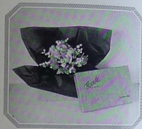
"Fleurette," a fragrant bouquet of tiny flowers blended to order. It is an exclusive Simmons creation. From Simmons and Son, Yonge St., at Elm, Toronto

A soft photoframe of suede or pebbled leather will allow you to carry the favorite one's image about without damage. Isn't it remarkable how much joy a photograph gives when on the wing, so to speak?