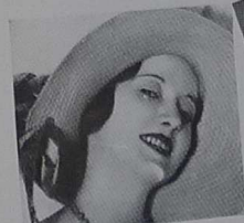
GENEVIEVE TOBIN Fifty Million Frenchmen