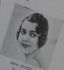
IRENE DELROY Top Speed

First Sweeping Hollywood— then Broadway—and now the European Capitals 10¢