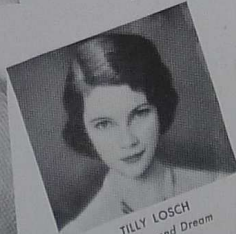
TILLY LOSCH Wake up and Dream