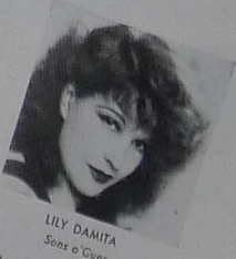
LILY DAMITA Sans o' Guns