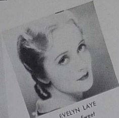
EVELYN LAYE Bitter Sweet