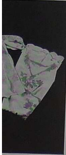
Turquoise blue to crêpe satin. The matching jacket and blouse trimming. A Holt-Renfrew Ltd.