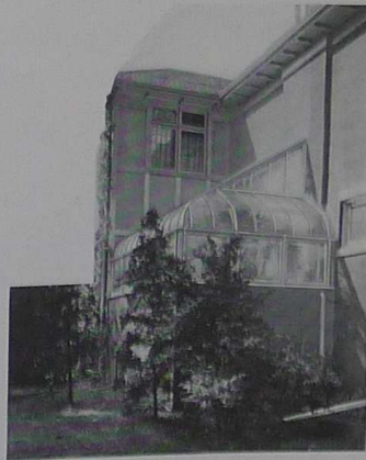
The charming conservatory shown below is that of Mrs. Wm. Cornell, Toronto.

the use of a special glass which will promote free passage of the ultra violet rays into your home. They would be of priceless benefit during winter days... especially if you have a delicate person in the house. Ask our Toronto Office for Vitalarium Literature; also for a copy of "What is So Rare as a Day in June?"