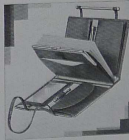
Latest novelties in leather goods.