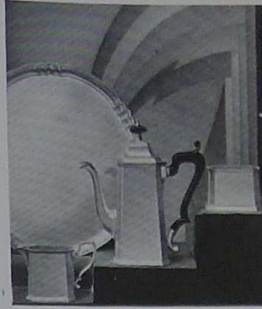
Sterling Silverware of fine craftsmanship.