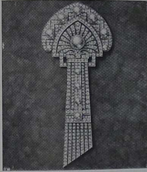
Fine Jewels of modern and exclusive designs.