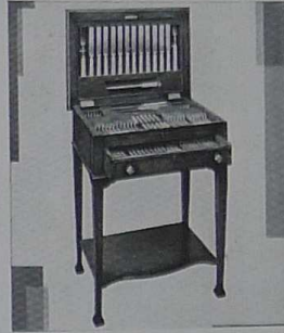
Table Furnishings in Regent Plate.