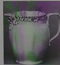
Above: Bacchus, surrounded by the symbol of his deity, in an interesting relief motif is the unique decoration on this jug. A Sheffield replica. Roden Bros.