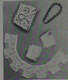
Right: Costume jewelry, an underarm bag of modernistic linen, and the collar and cuffs in lace and pleated georgette, are chic spring accessories. The Evangeline Shop