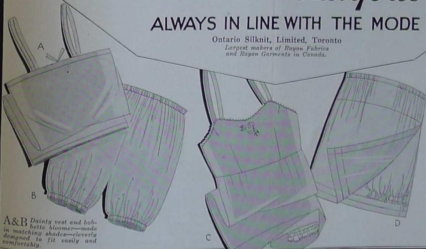
A&B Dainty vest and bob-bette bloomer — made in matching shades — cleverly designed to fit easily and comfortably.